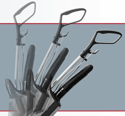
The handle is adjustable so that it is comfortable to use regardless of the user's height. Lowering of the body allows cleaning beneath furniture